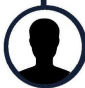
PR & Comms Trustee