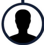
Building & Facilities Representative Trustee